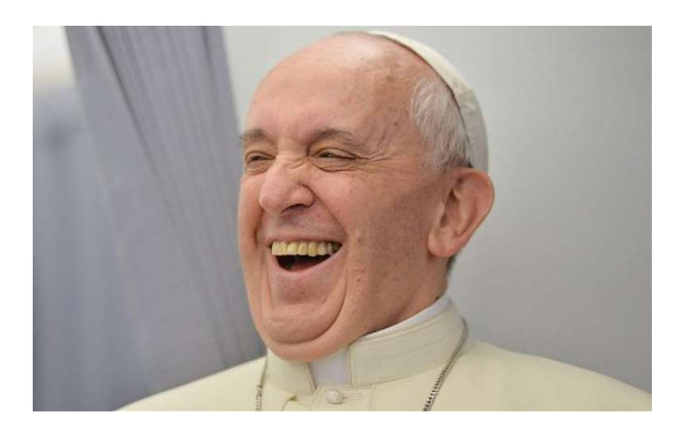
On The Lighter Side

3. Who makes it, has no need of it. Who buys it, has no use for it. Who uses it can neither see nor feel it. What is it?